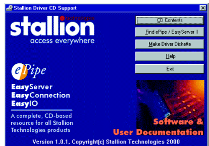
Figure 2 - Auto Start Screen